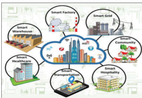
Figure 1 Generic applications of a smart city [36].

One of the main requirements for smart cities is to reduce energy consumption, which in turn leads to pollution from cities, as it helps in assessing energy performance and emissions in cities and regions. Information and communication technologies allow several applications in the field of environmental monitoring by providing promising measurements of the climate of temperature, humidity, speed and winds. And others, and provide direct measurements on pollution levels in the city and provide direct information on the locations of faults in the networks [35].